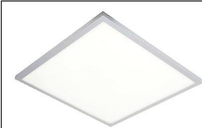
Drawing of the Product, Reference Picture